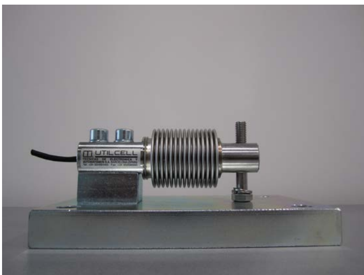
Base Plate + Load Cell + Load Bolt